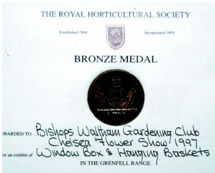
Bronze medal certificate 1997

The Annual Dinner became a regular feature, as did entry into the Hampshire Federation of Horticultural Societies Quiz and entry initially to the Chelsea Flower Show and lately to the Hampton Court Flower Show as corporate members of the Royal Horticultural Society.