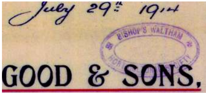
Detail from the picture above showing the stamp of Bishops Waltham Horticultural Society and the date