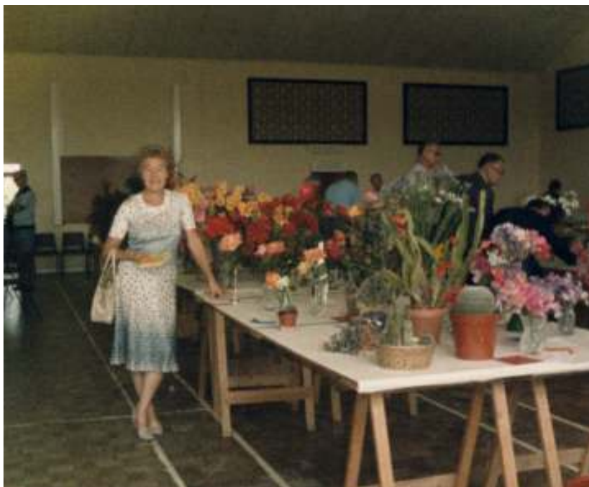
The Annual Show 1985