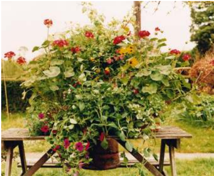
Entry for the Hampton Court Flower Show 1998

One significant development has been the entry of The Annual Show in the Hampshire Federation Competition for Show Quality. This has achieved 3 gold medals! Membership of Garden Organic which is the working name of the Henry Doubleday Research Association (HDRA), the national charity for organic growing, reflects trends in organic gardening and growing crops without chemicals.