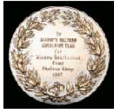
Bronze medal 1997